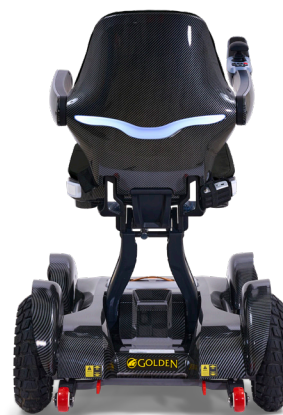
High-Tech Styling Includes Highly Visible Side & Rear Lighting

Literature is current at time of printing. Golden Technologies reserves the right to make changes to the product or literature at any time.