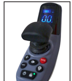
Right or Left Hand Controller