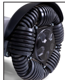
Omni-Directional Wheels w/ Self-Cleaning V-Groove