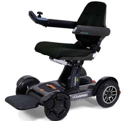
Shown in Black Carbon Fiber Pattern